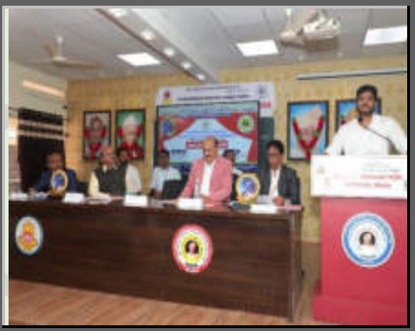
Welcome and felicitation